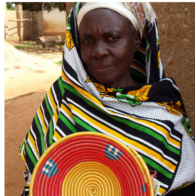
A home-based Nubian craft producer in Kenya.

Globally, women home-based workers are more than twice as likely as men to be contributing family workers. Conversely, men are more likely than women to be employers or own account workers. But men and women home-based workers are equally likely to be employees ( table 4 ). This pattern is also reflected in developing and emerging countries, where the overwhelming majority of home-based workers are concentrated: 13 per cent of both women