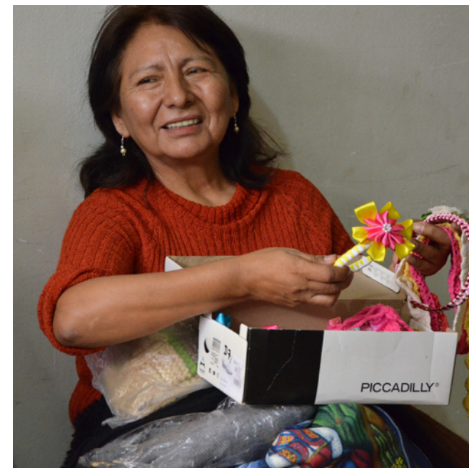
A home-based worker who makes hair accessories in Lima, Peru. Photo by Sofia Trevino.

Source: ILO calculations based on labour force survey (or similar household survey) data from 118 countries.