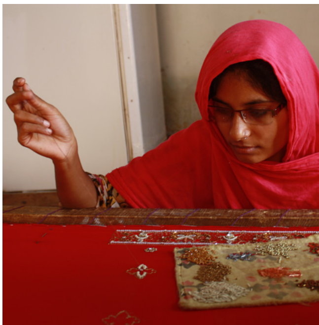
A beadworker in Pakistan.

Globally, around one third of women and men home-based workers work 35-48 hours a week. In developed countries, a little less than