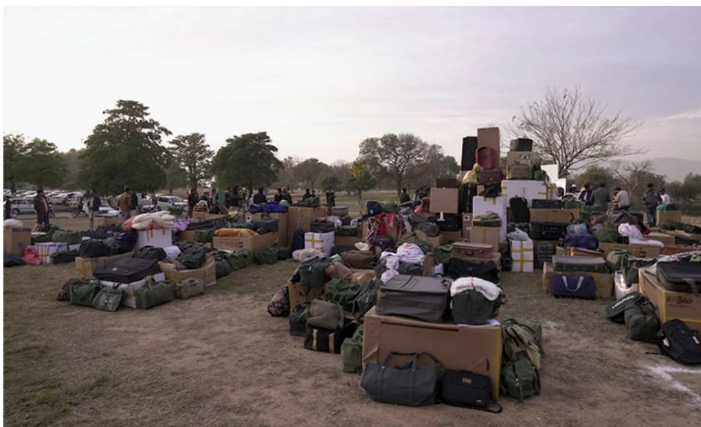
The suitcases as part of the installation representing migrant workers languishing in foreign jails.