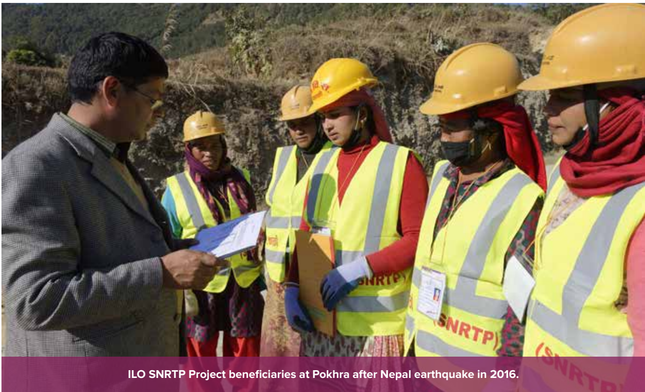
ILO SNRTP Project beneficiaries at Pokhira after Nepal earthquake in 2016.

It is expected that the disaster-affected areas would see a higher level of reconstruction activities in the short- to medium-term. While the infrastructure build-back would be driven mainly through public spending, private expenditure on reconstruction is also expected to go up. Reconstruction activities would require a workforce with multiple skills, and most of such works would be contracted out. Construction enterprises from other regions of the country or even internationally could also seek these contracts and send their workforce for reconstruction projects. As and when construction activity momentum picks up, key issues may be expected to emerge around