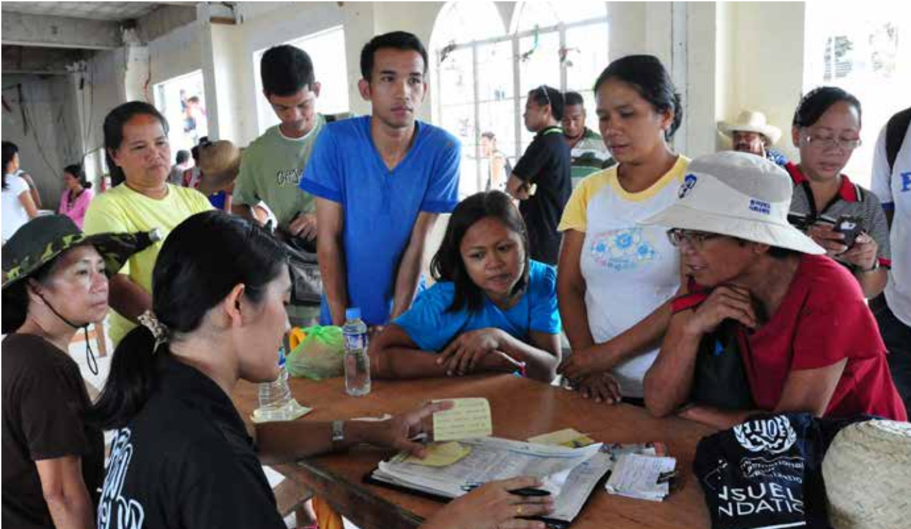
The Philippine government, with ILO's support, rolled out emergency employment programmes in areas most affected by Typhoon Haiyan, including Tacloban.

umbrella, almost 80,000 informal sector workers subscribed to the national insurance schemes while benefitting from immediate relief from the aftermath of Haiyan.