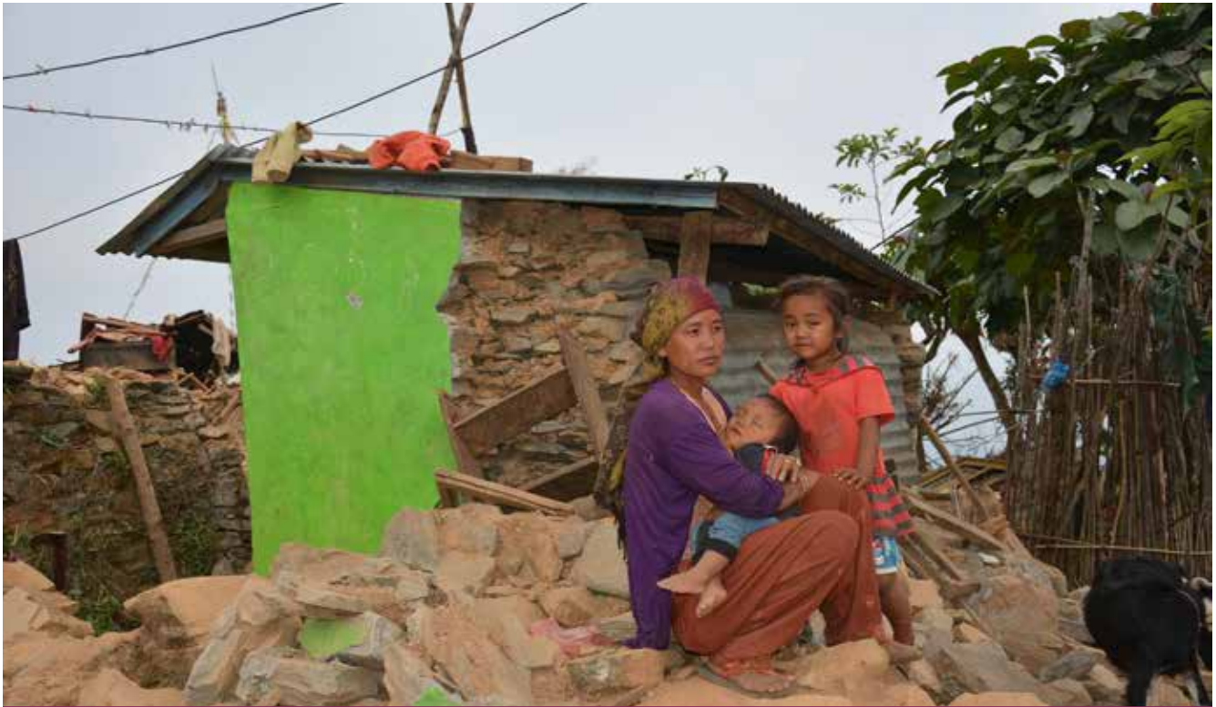
Women and children along with persons with disabilities are some of the most vulnerable during disasters (Nepal earthquake, 2016).

higher risk of catastrophes, the poor are evidently more vulnerable than the non-poor with higher losses to incomes, assets and lives. Sustained low incomes, lack of savings, weaker social networks, low asset bases and heavy reliance on climate-sensitive livelihoods renders all these groups with limited capacity to cope with natural disasters.