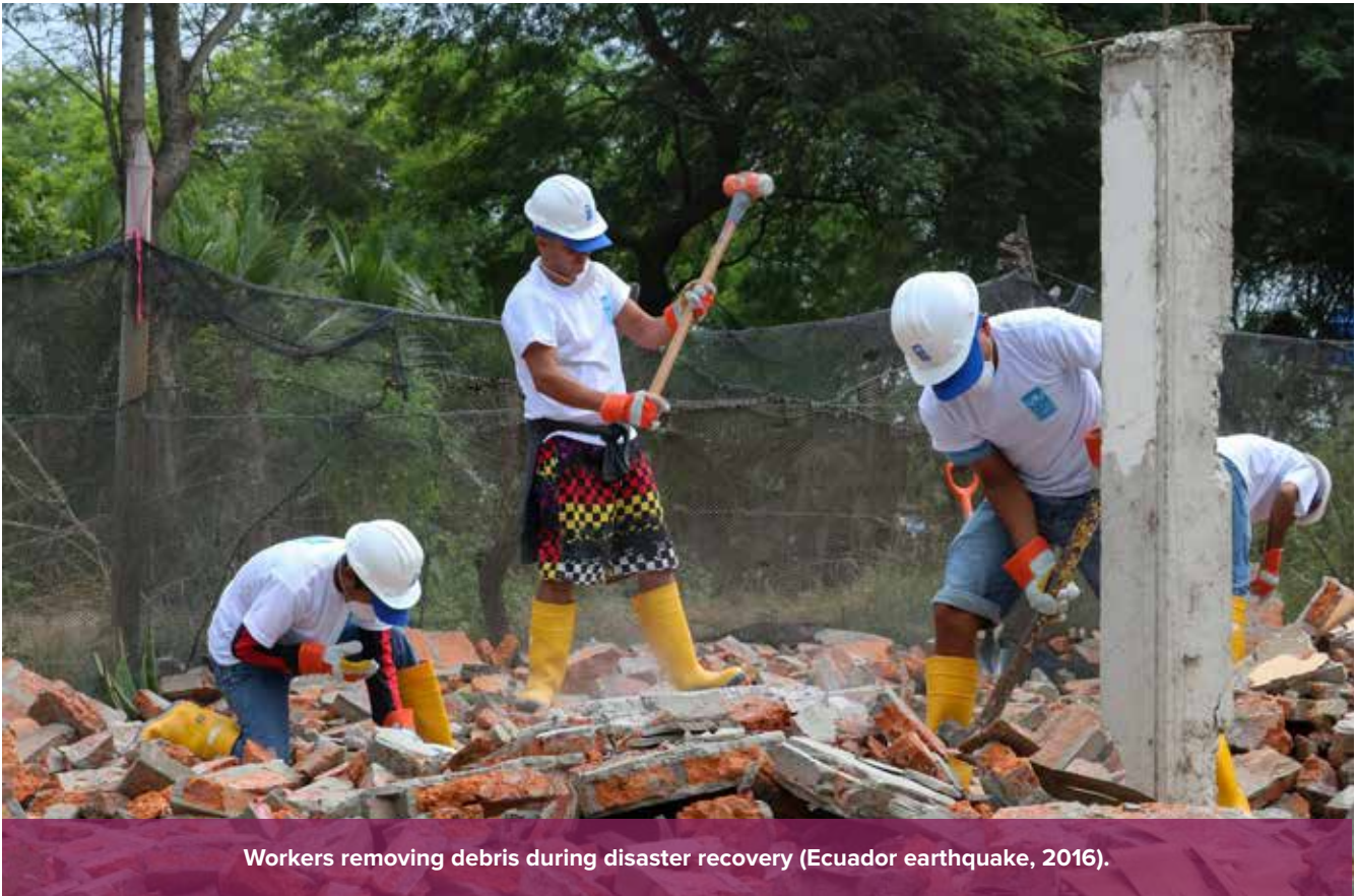
Workers removing debris during disaster recovery (Ecuador earthquake, 2016).

When Climate Change Adaptation (CCA) is part of disaster relief, in addition to providing immediate income and employment for the affected communities, it also improves their access to future employment opportunities and livelihoods and creates infrastructure solutions and assets that strengthen resilience to future shocks. 24 Key areas of CCA through Green Works include: 25