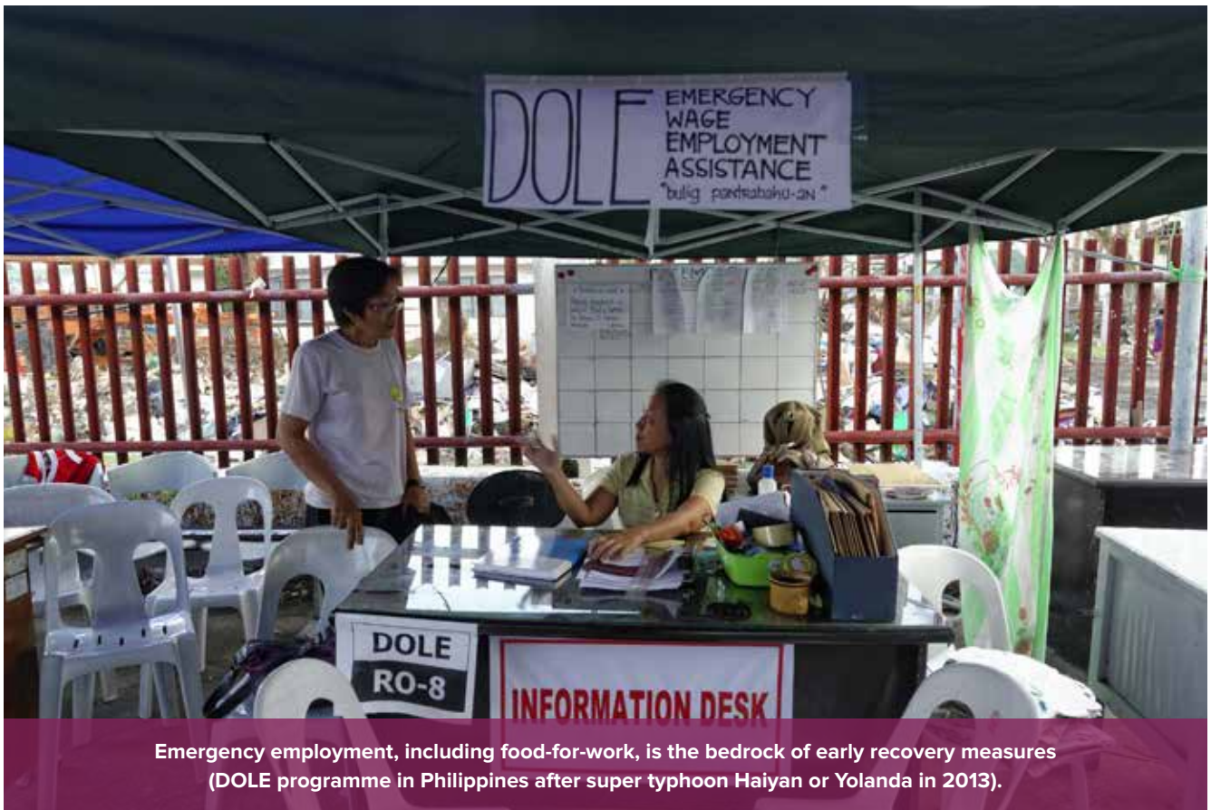
Emergency employment, including food-for-work, is the bedrock of early recovery measures (DOLE programme in Philippines after super typhoon Haiyan or Yolanda in 2013).

At the early recovery phase, the cost of production of goods and services almost always increases while restarting the affected economy. These costs continue to be high till volumes in production units pick up, agriculture produce and harvests come in, access to markets and inputs improve, and value chains stabilize. In this transition period, most enterprises generate lower revenues, incur higher operational costs, and remain vulnerable to even minor supply-chain shocks. Facilitating subsidized and government-guaranteed credit schemes for this period, especially to the MSMEs, in addition to their pre-existing limits without collateral (as the underlying asset may have been damaged) can provide a much-needed source of cheaper credit to affected, smaller enterprises to meet their working capital needs to source inputs