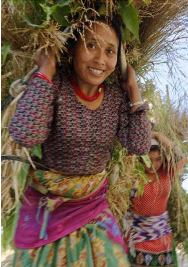
Women farm workers in a post-disaster area (Nepal earthquake, 2016).

the PDNA Guidelines (Volume B) 3 for the estimated effects and impacts of a disaster on the cross-cutting ELSP sector, factoring in the assessed damage and loss to infrastructure, productive and social sectors. This short, action-oriented Guide aims to assist senior advisers and officials from the national, provincial and local governments, intergovernmental organizations