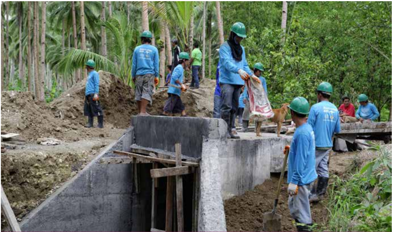
People being provided on-job training while constructing a box culvert as part of the ILO AusAID emergency employment programme (Washi or Sendong tropical storm, 2011).