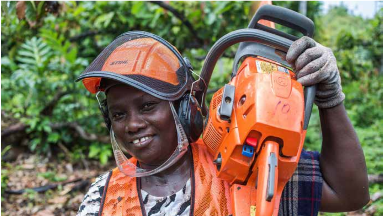
Promoting skills development not only provides livelihood opportunities to the disaster-affected people, but also facilitates implementation of activities to restore basic services in disaster-hit neighbourhoods (Rehabilitation and reconstruction programs in Haiti after the 2010 earthquake)