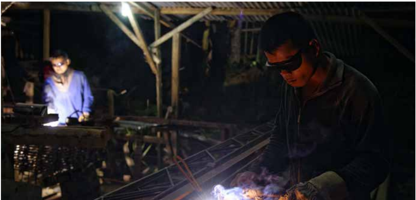
Emergency employment-linked integration of MSMEs and skilling (after tropical storm Washi or Sendong hit Philippines in 2011).

Thus, it becomes imperative for governments to immediately begin providing small capital grants or opening a window for MSMEs to avail collateral-free credit on easier terms for refurbishment or replacement of machinery, either of the same technology or of more advanced technology (for example, green) and associated equipment. Many countries set up public-funded industrial areas, parks and special economic zones to host and support MSMEs of different types including cooperative enterprises. In such cases, increasing the resilience of industrial estate infrastructure also becomes important to help MSMEs recover faster and strengthen their own resilience.