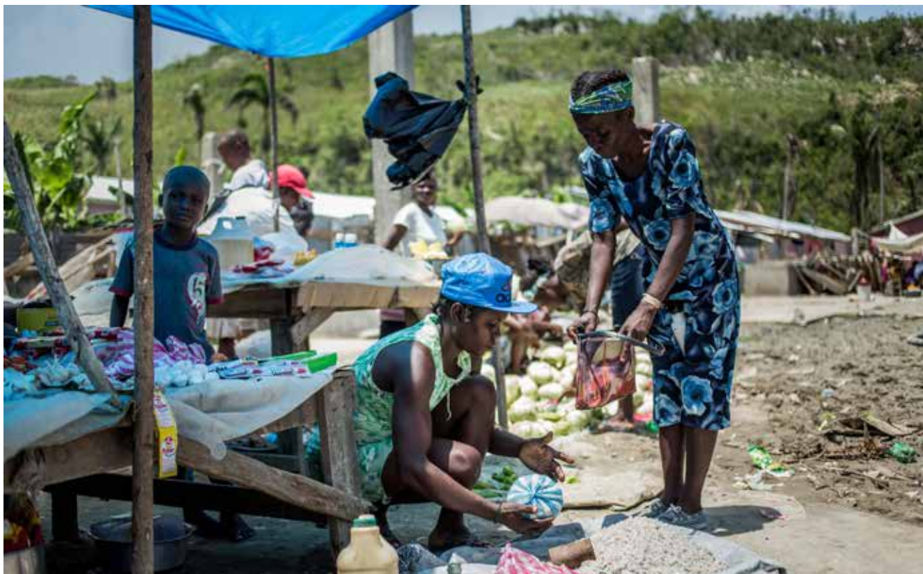
Women selling and buying essential items at a post-disaster makeshift shop (Haiti earthquake, 2010).