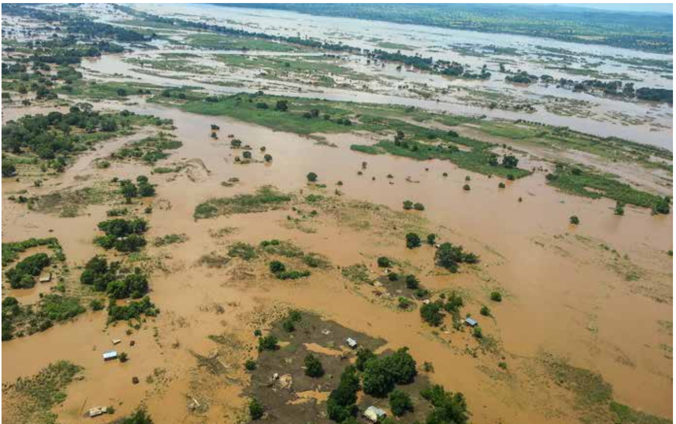
Damage to entire habitat (Malawi floods, 2015).

A disaster also diminishes the capacities of local governments, local offices of central government agencies, chambers of commerce, employers' and workers' organizations, civil society organizations, small and medium