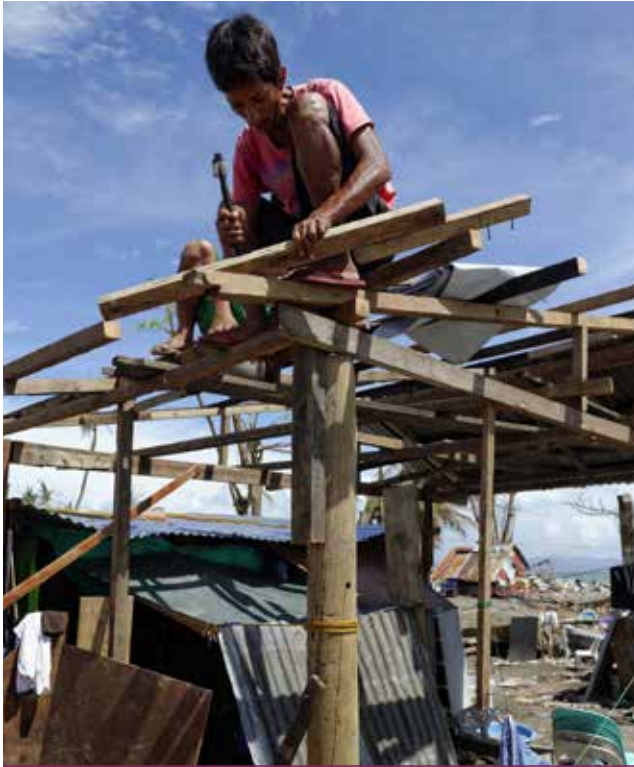
Millions of people on the unfavourable side of the digital divide struggled to rebuild their lives and livelihoods after typhoon Haiyan hit Philippines in 2013.