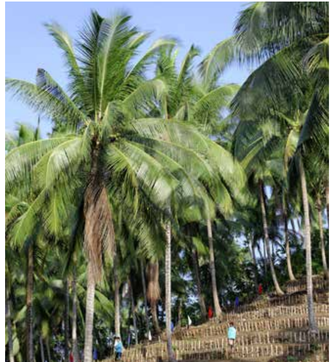
Sloping agricultural land technology (SALT), aimed at increasing productivity and preventing floods or damage to crops, was deployed to rebuild farming communities in keeping with an ecosystem perspective (after tropical storm Washi hit Philippines in 2011)