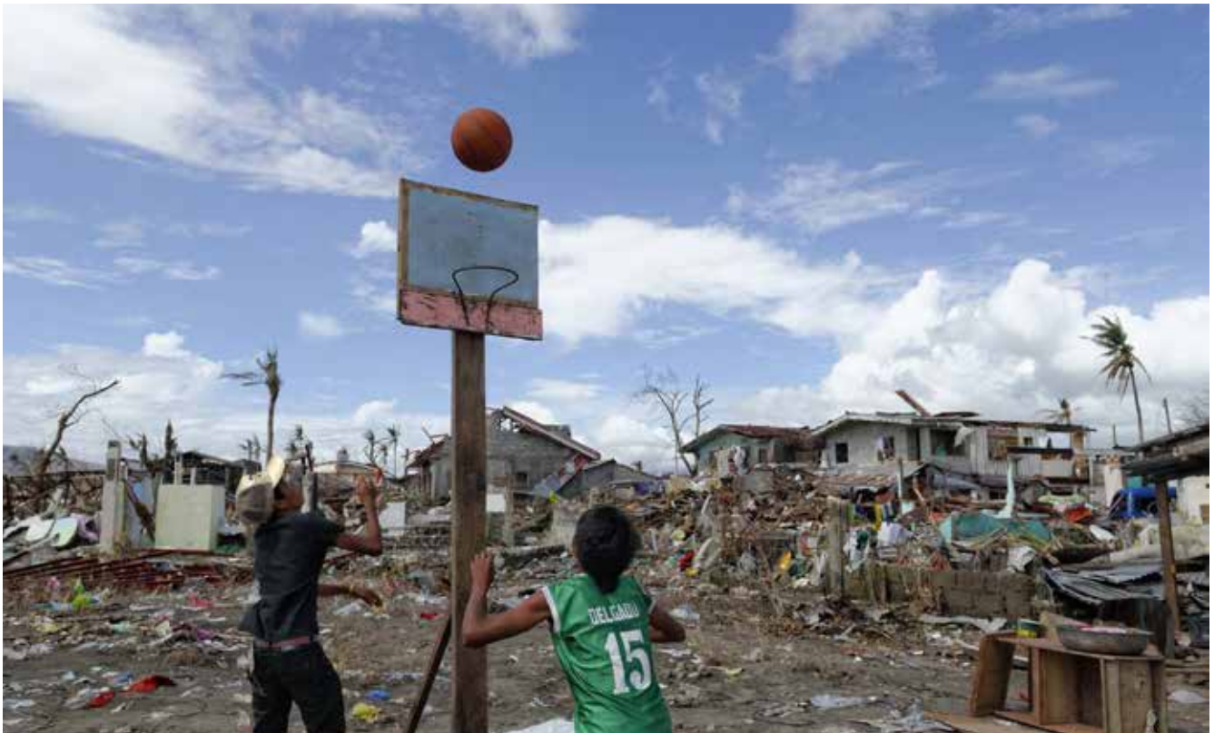
Above all, hope and fortitude in full display at Tacloban city (after typhoon Haiyan hit Philippines in 2013).