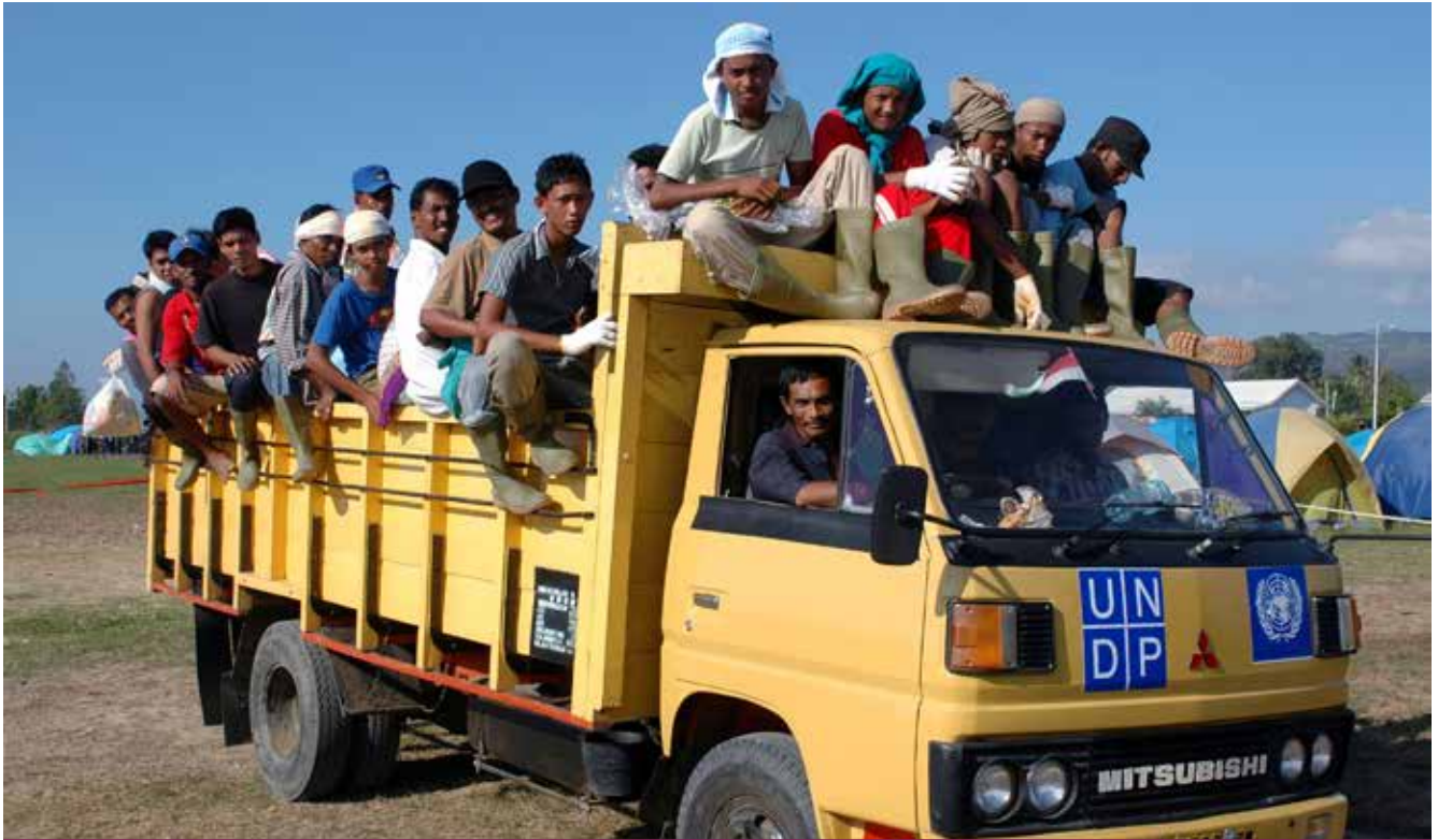
Disaster recovery-linked emergency employment such as garbage collection at refugee camps bring much needed succour to affected populations that have lost livelihoods (Banda Aceh, Indonesia tsunami, 2004).

approach enables recovery and building resilience through job creation and promotion of decent work. 14 The ILO recognizes decent work as the foundation of sustainable poverty reduction that paves the