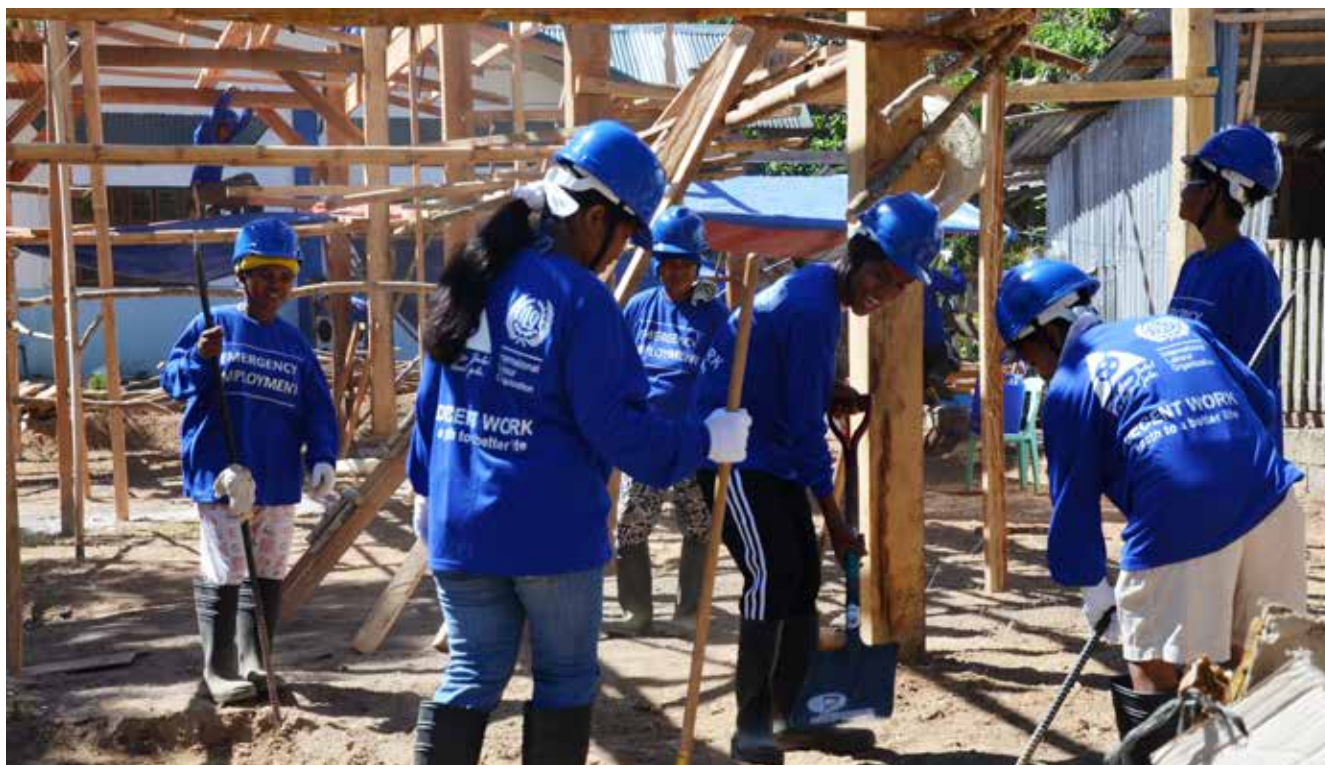
Workers build a centre to produce Sawali split bamboo mats used for walls of tourist resorts and hotels (to transition to medium-term labour-based community work, skills training and enterprise development) in Coron, Palawan (Philippines) under an emergency employment programme after the 2013 typhoon Haiyan (Yolanda).

To overcome the ill-effects of TC Winston the ILO's technical assistance fostered the adoption of a national employment policy embodying effective and responsive on-ground strategies. This initiative translated to three key interventions for recovery that were implemented (summarized below). 94