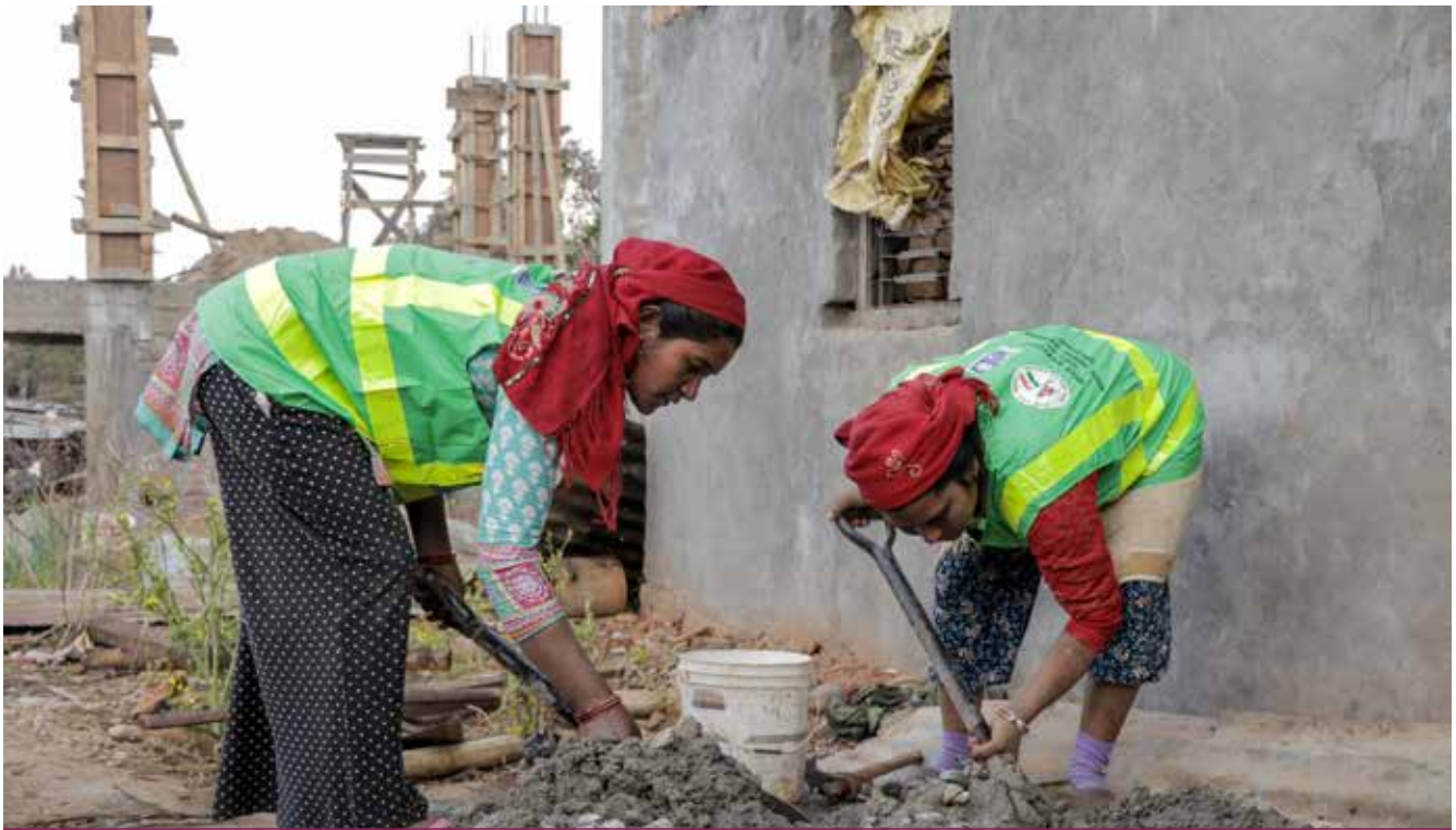
Reconstruction by women beneficiaries for the housing sector under Nepal India Cooperation, anchored by UNDP in 2019, adopting build back better practices (earthquake-resistant).