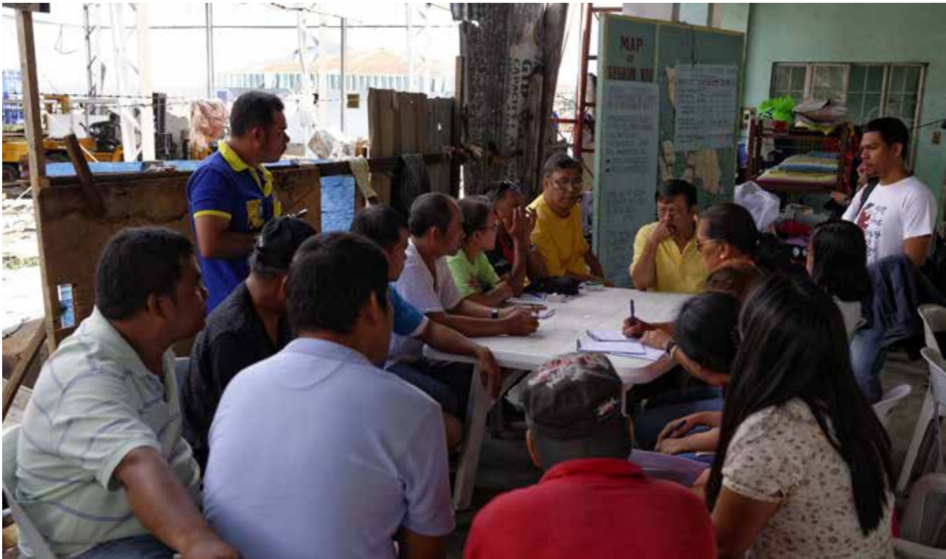
ILO officials discuss emergency employment needs with officials of the DOLE in Tacloban after super typhoon Haiyan hit Philippines in 2013.

of enforcement of the labour law may allow those who profit from disaster to act with impunity, especially in such matters as forced labour, child labour, trafficking of children or workers, and exposure to hazardous working conditions. This may have long-term effects on the observation of International Labour Standards in the country. 54