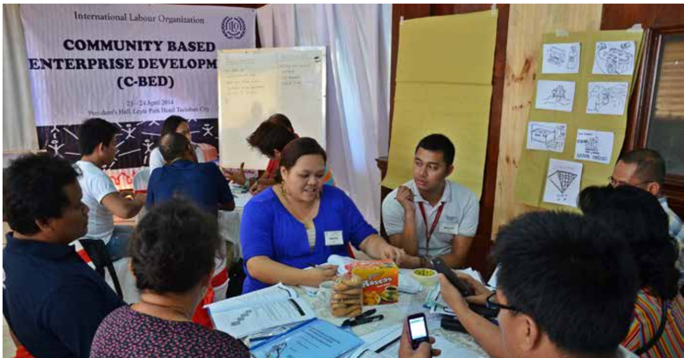
Small-scale business owners, vendors and aspiring entrepreneurs learn the basic principles of business development through the Community-Based Enterprise Development after typhoon Haiyan or Yolanda hit Philippines in 2011.

The active participation of key economic and labour market stakeholders in the recovery-planning process is essential for developing a well-targeted and inclusive ELSP recovery framework. Besides involving national and local government functionaries and public and non-governmental institutions, efforts should be made to facilitate the participation of representatives of the affected population as well as other civil society organizations that may be active at the local level. These stakeholders should be consulted in planning the recovery, identifying and prioritizing interventions, area-specific programme preparation, and thereafter kept in the loop throughout the implementation stages in disaster-affected zones. Adopting such broad-based, consultative approaches enhances information exchange, permits negotiation and advocacy, leading to inclusive decision-making.