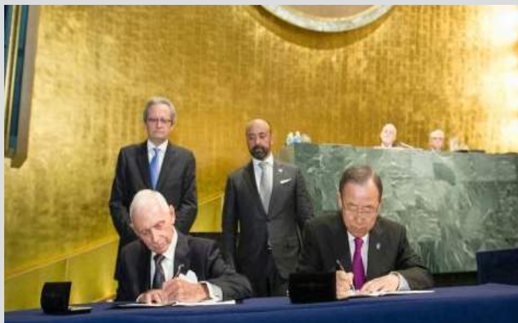
IOM Director General William Lacy Swing (seated left) and UN Secretary General Ban ki-Moon at the signing ceremony at UN HQ, New York on 19 September 2016

This historic event shows a world is on the move and in the words of the our Director General, Ambassador Swing “ [it] brings the leading global migration agency, International Organization for Migration (IOM) – into the United Nations – the culmination of a 65-year relationship. For the very first time in 71 years, the UN now has a ‘UN Migration Agency’ [which is] a singular honour for our Organization – and a genuine success for migrants and Member States and indeed for this Summit.”