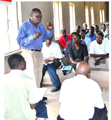
The Chief Executive Officer of TAMA addressing participants